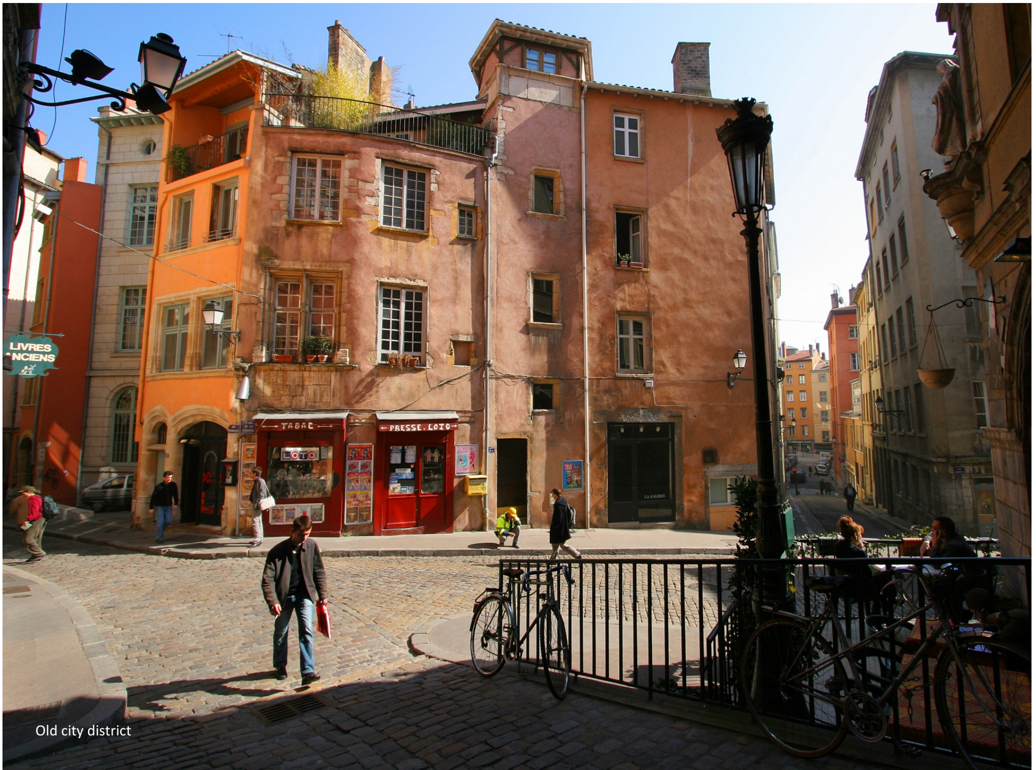
Old city district